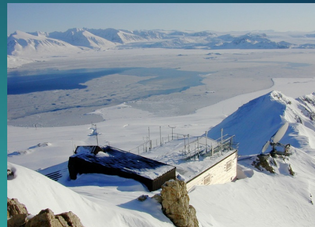
Fig.1: Zeppelin sampling station, Spitsbergen, Norway